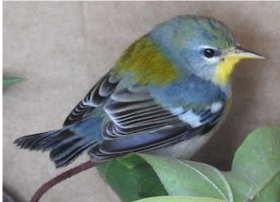
Northern Parula.

IRC has an E-Trade account. Please contact us about giving gifts of stock.