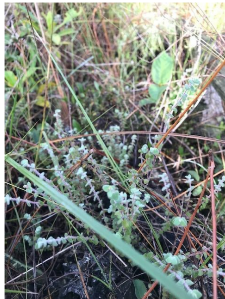
Above: Species that benefited from this effort include the federally endangered Galactia smallii (pictured left) and federally threatened Euphorbia deltoidea subsp. pinetorum (pictured right).