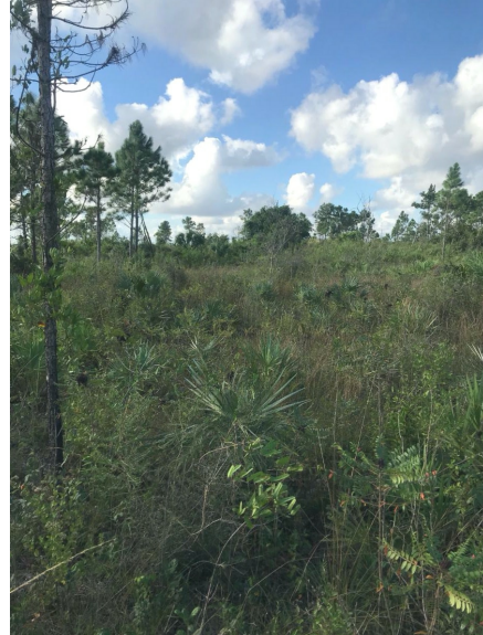
Above: After hardwood reduction. The understory has recovered and more diverse mosaic has been developed.